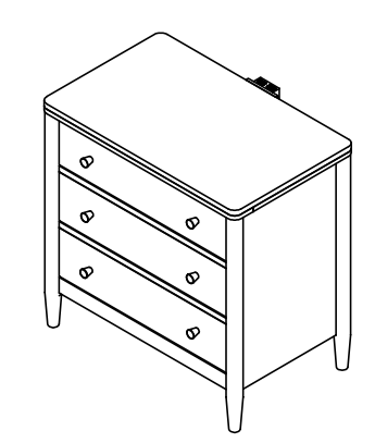
37569 3-D rawer Nightstand